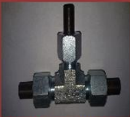
Weld Nipple-equal tee