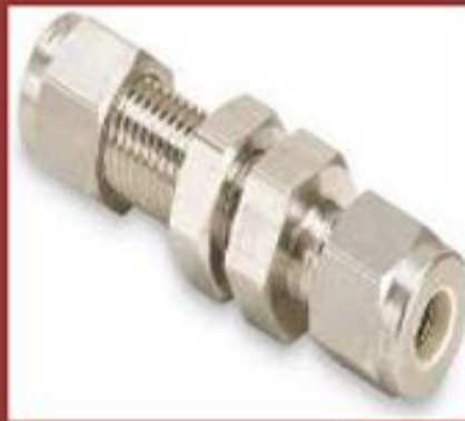
Swivel Bulkhead Union Fitting