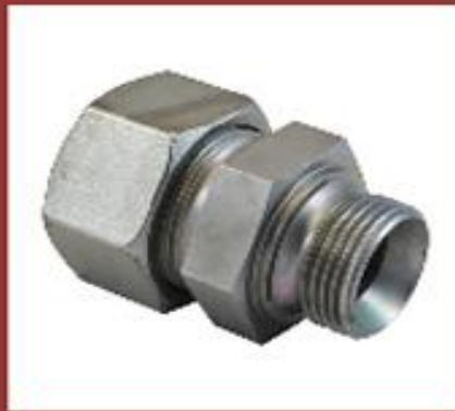
PMSC Hydraulic Fitting