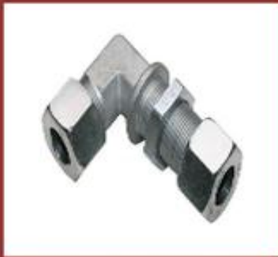
Equal Bulkhead Elbow Coupling