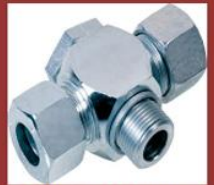
Banjo Tee Coupling