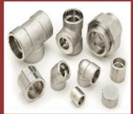
Socket Weld Fitting