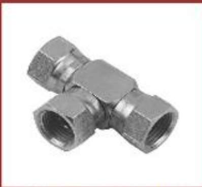
Swivel Tee Connector