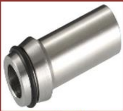
O Ring Nipple