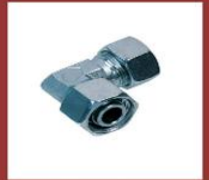
Swivel Elbow Connector