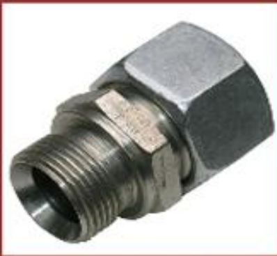
Parallel Male Stud Coupling