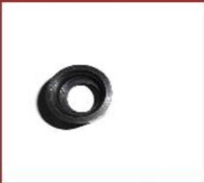
Socket Weld Fittings